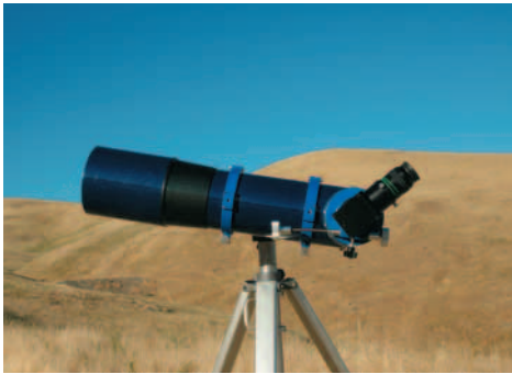
As this series of photos demonstrate, the eyepiece of Ayers's telescope remains at a comfortable height and angle, regardless of where the instrument is aimed.