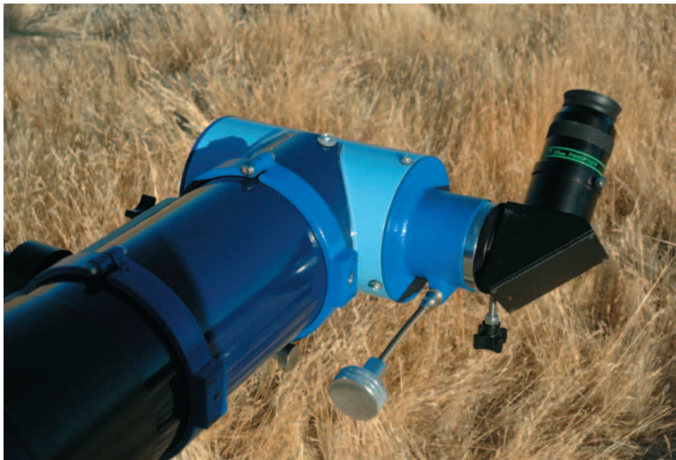
The key to the scope's design is the ability to adjust the tilt of the eyepiece independent of the telescope tube's orientation. This is accomplished by adjusting the angle of the RFT's star diagonal.

ger (and more expensive) the diagonal mirror becomes, and the more ungainly the finished telescope looks.