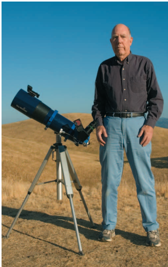
The author stands next to his “bent” rich-field telescope (RFT) — a 6-inch f/5 refractor modified to provide comfortable views no matter where it is aimed in the sky.

dition, the two bends eat up enough of the scope’s focal length that the focuser is closer to the altitude axis of the mount. As a result, the eyepiece is always at a convenient angle and at a relatively constant height.